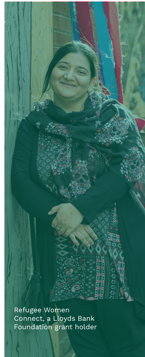
Refugee Women Connect, a Lloyds Bank Foundation grant holder

Smaller charities have the potential to contribute to the transformational change needed if the economy and society is to 'build back better' following the pandemic, but we found that their transformative capacity is currently constrained by the local and national public policy environments in which they operate. Crucially, there is a need to recognise that the real value of smaller charities during the COVID-19 pandemic has been the fact that they continue to be there for the people and communities that need them the most and in ways that mean they are distinctive from public services and many forms of informal support.