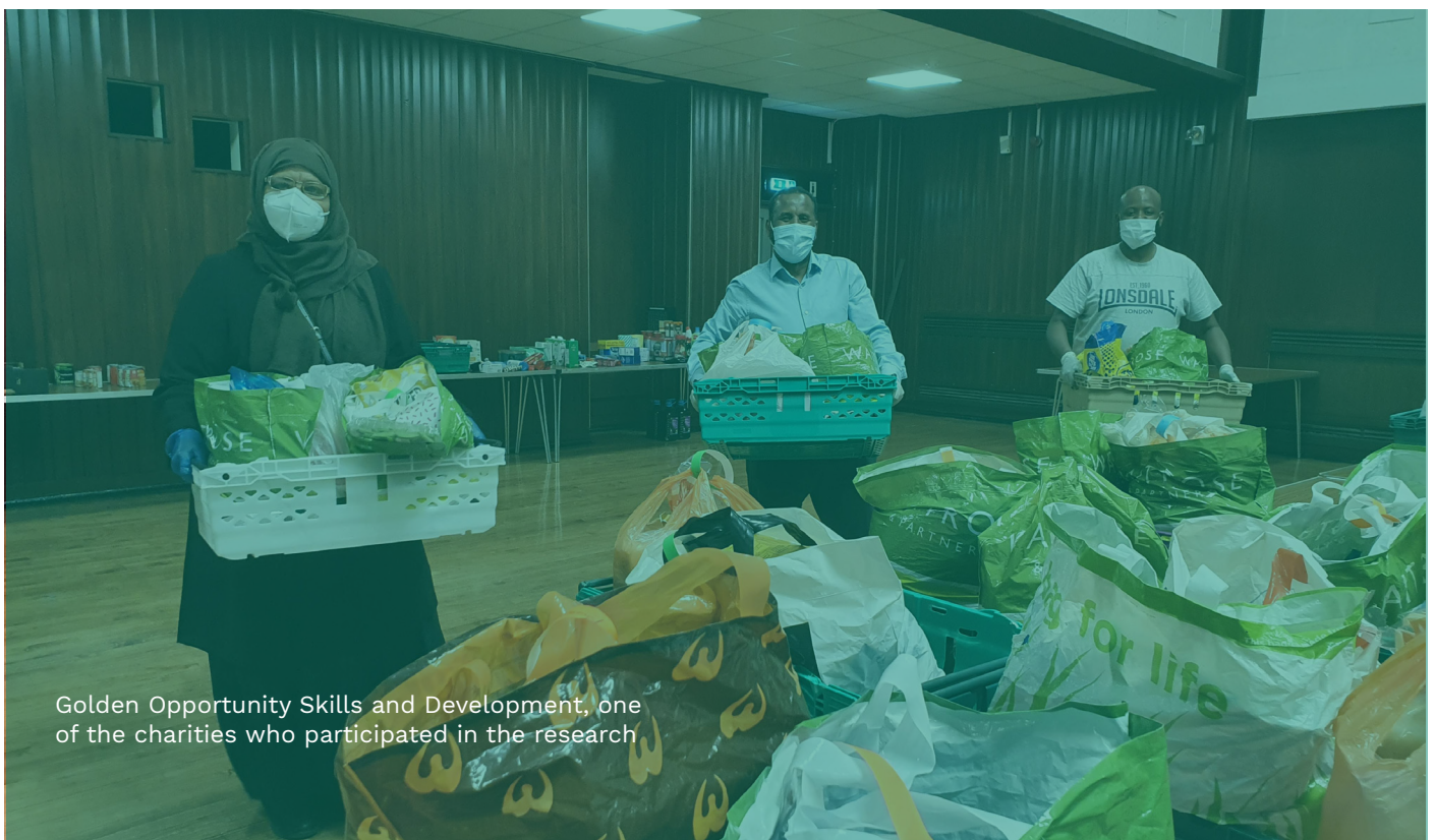
Golden Opportunity Skills and Development, one of the charities who participated in the research

This highlights how a key role for a smaller charity, particularly in the face of a crisis, is contributing to personal outcomes that can prevent someone's life from getting worse in the short term. This can create stability and mean these individuals will be in a better position at the end of the pandemic, and more likely to experience longer term 'harder' outcomes, than would have otherwise been the case.