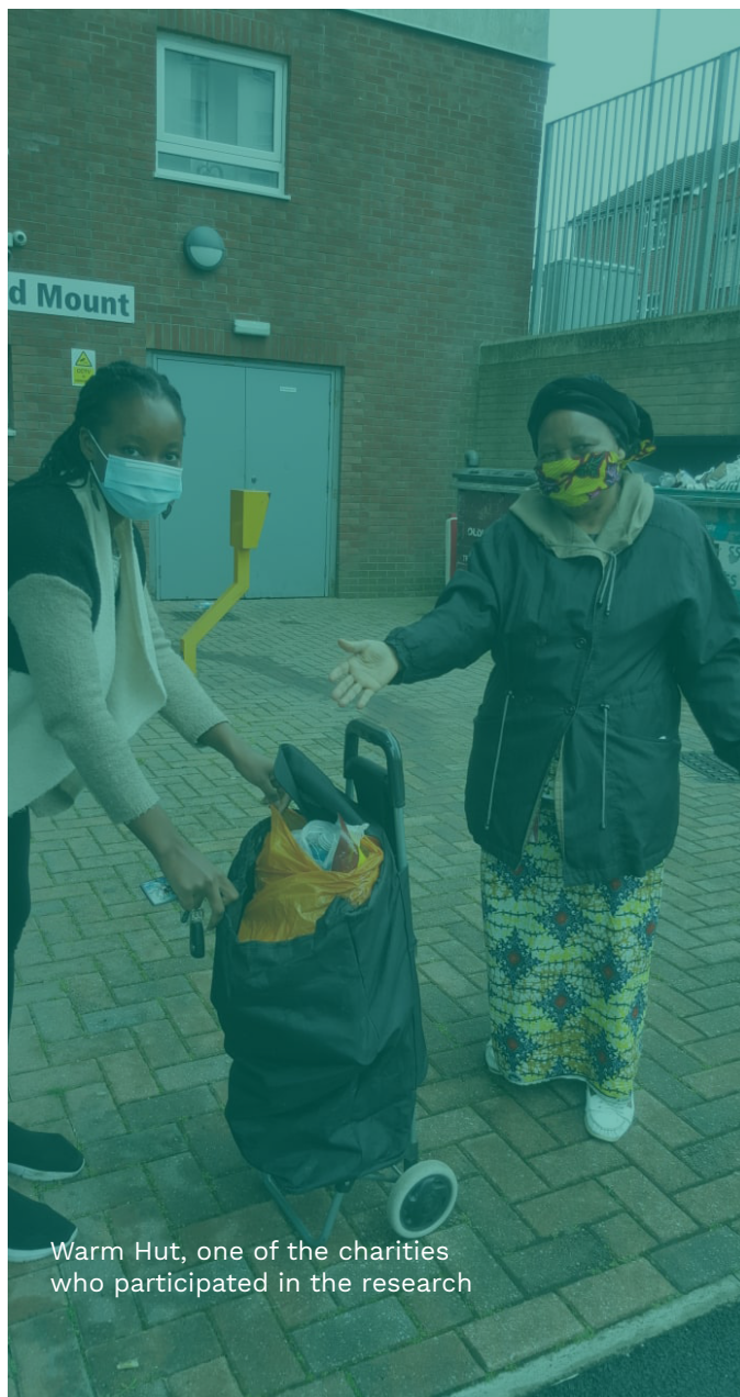
Warm Hut, one of the charities who participated in the research

This presented smaller charities with a moral dilemma about how to respond, and to do so in a way that met their clients' or communities' needs. They had to balance the needs of their beneficiaries for face-to-face provision with the wellbeing and safety of their staff and volunteers. Several smaller charities expressed the growing concerns about how the intensive ways of working and emotional burden taken on during the pandemic were taking their toll on the wellbeing of staff and volunteers, with 'burnout' considered a real and looming risk. In response, many small charities had made extra efforts to promote self-care and wellbeing, putting in place mutual support systems to ensure staff remained connected and supported, but concerns about the longer-term impacts remained.