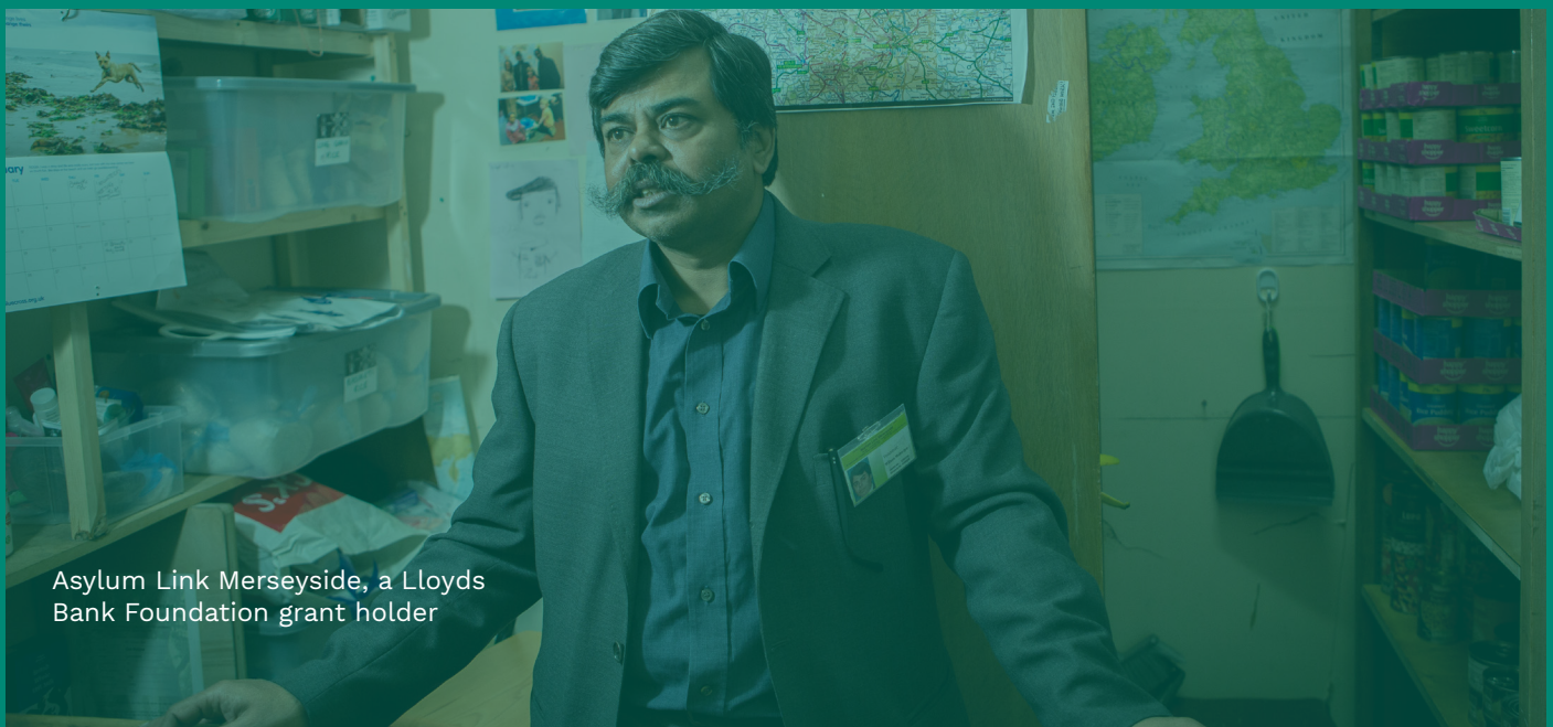
Asylum Link Merseyside, a Lloyds Bank Foundation grant holder

The evidence collected through this research have provided numerous examples of the absorptive and adaptive capacity of smaller charities and how this benefited vulnerable people and communities experiencing complex social issues during the COVID-19 pandemic. However, the findings also demonstrate the need for change on a larger scale if society and the economy are to fully recover and prosper following the pandemic. Smaller charities have the potential to contribute to the transformational change needed, but their transformative capacity is currently constrained by the local and national public policy environments in which they operate.